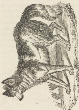
Hare Indian Dog.