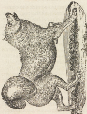
The Esquimaux Dog.