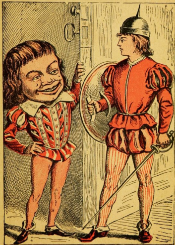
STRONG-ARM AT THE GIANT'S CASTLE.