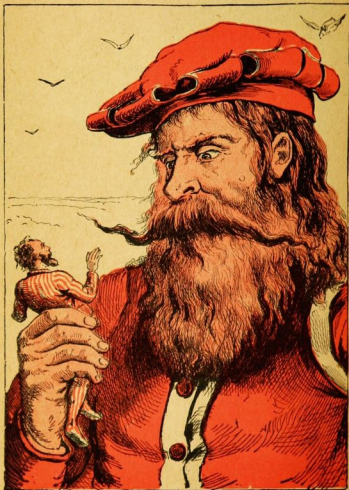
THE GIANT WHO CARRIED OFF THE WOOD-CUTTER.