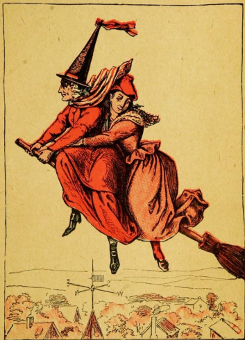
THE OLD WOMAN AND THE WITCH.