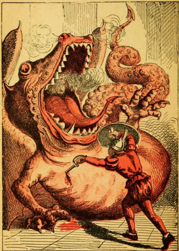
STRONG-ARM KILLS THE DRAGON.